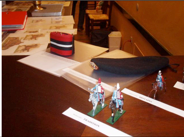
"Tradition" mounted and dismounted figures, on the last picture you can see the regimental stabelle-belt and a beret carrying the regimental badge.