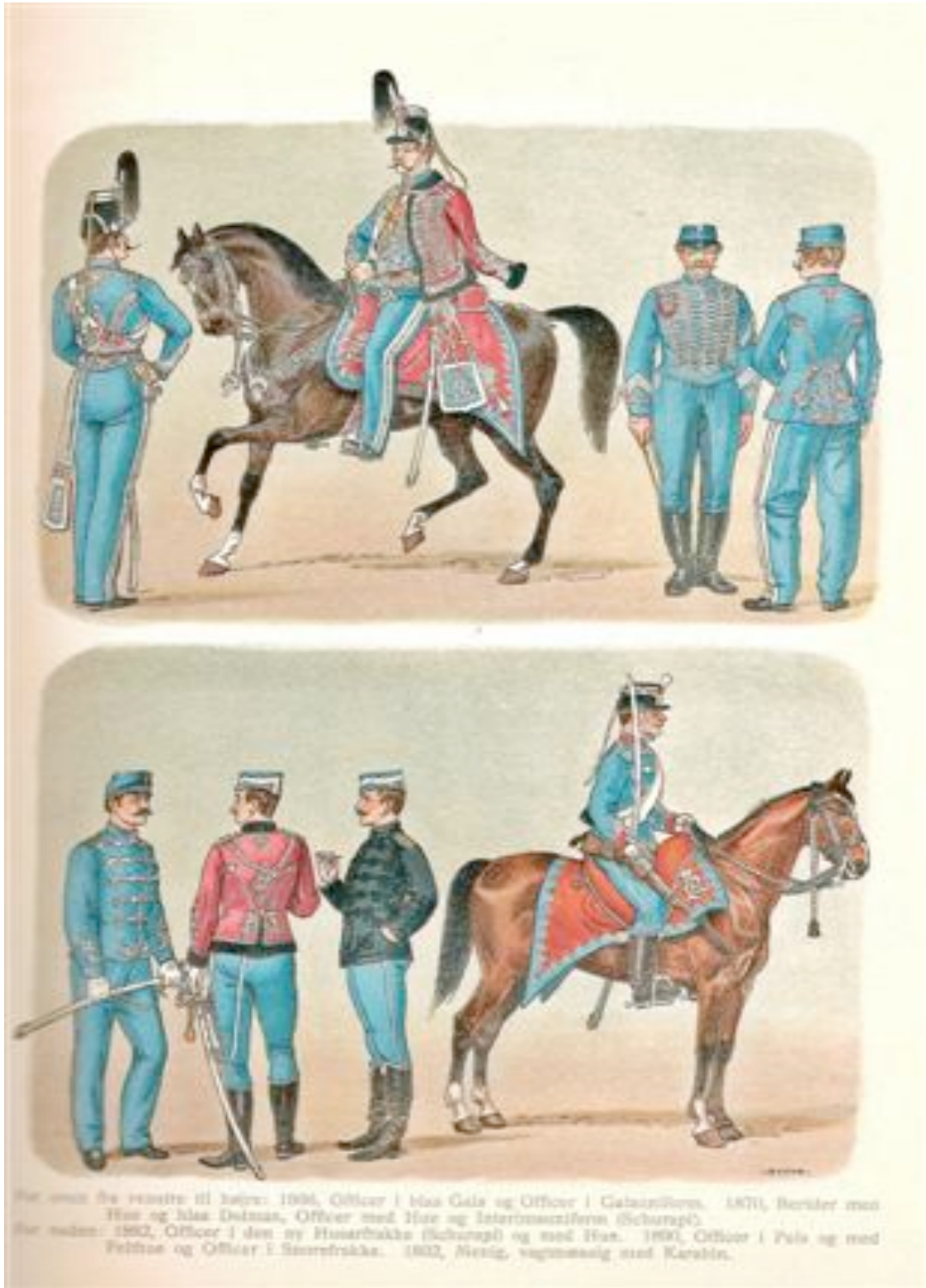
Uniforms from different times.