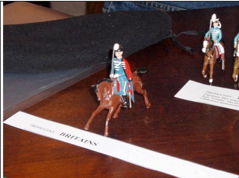
The well known "Britain's" Danish hussar.