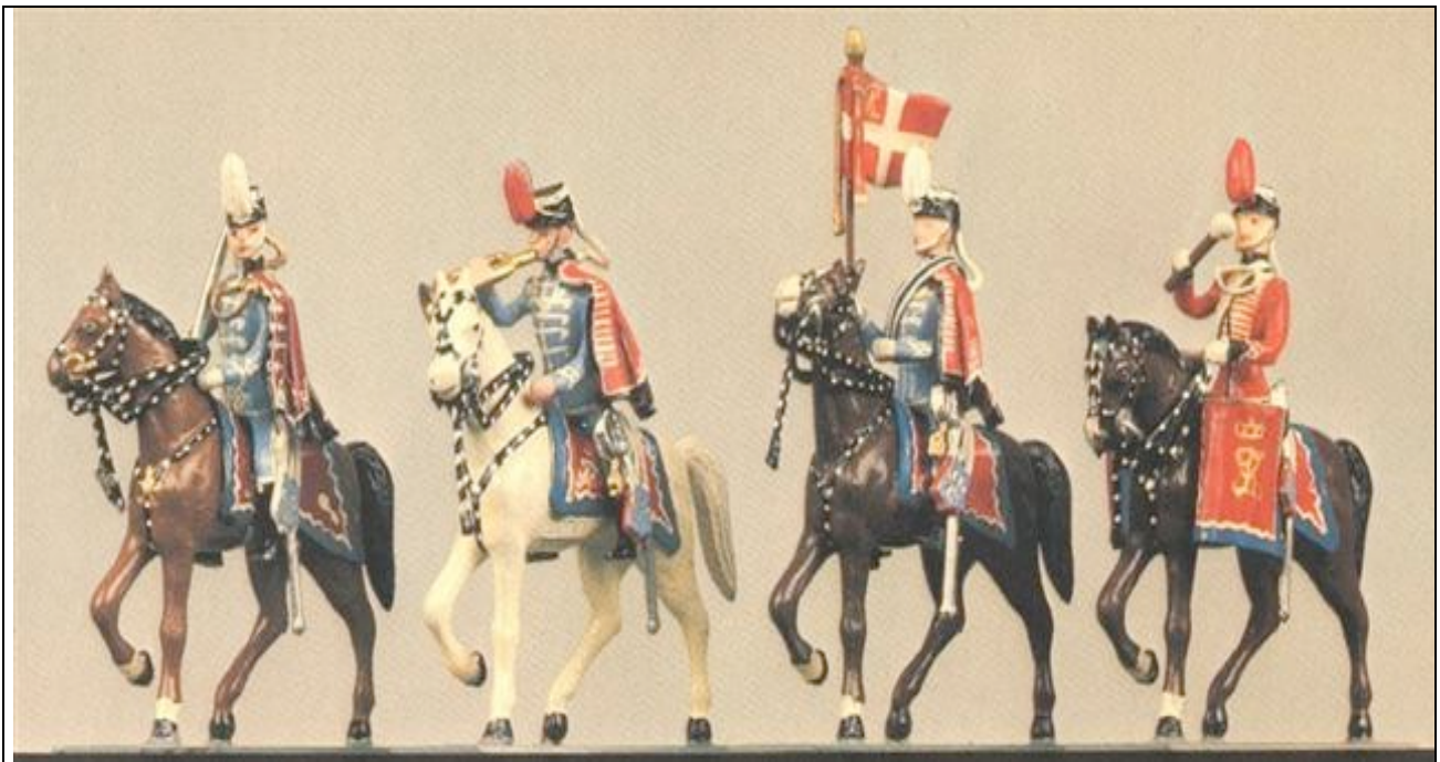
Toy soldiers 5 cm; type "Brigader" made in Denmark from 1946 to 1977.