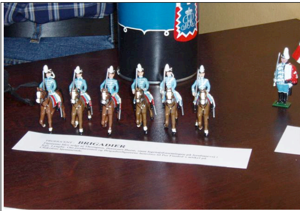
"Brigader" figures and a single "Tradition" figure.